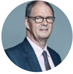
Lord James Arbuthnot F.ISRM

Lord James Arbuthnot was one of the very first people we invited to join our initial collection of Fellows when we established the ISRM in March 2019. He was recognised as a leading player in the UK's national resilience dialogue and was someone we naturally wanted to be part of the ISRM network.